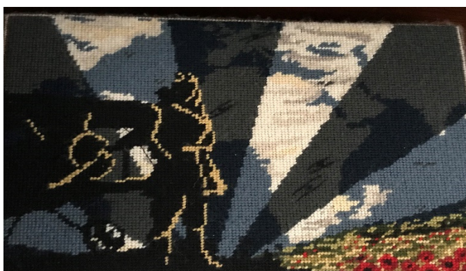
VE day made this kneeler image particularly noticeable and appropriate

Here are a couple of pictures from inside Everton St Mary's on Tuesday this week: