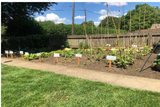
The thriving vegetable patch

The children have enjoyed baking and have made so many different recipes. I think their favourite, so far, is banana bread. We've gone for walks around our beautiful home in Hatley St. George with our dog Logan and the garden has never looked so good. Daddy managed to build us a patio a few weeks back and, as if all that wasn't enough, our cat Nala had kittens and our other cat, Bhindi, looks like she's fit to burst any minute now with her kittens (note to self, we should have got them spayed!). We haven't seen Yai Yai (Nanny in Greek) and Pops for 12 weeks now, and that's been so hard for the children and my parents, but we continue to pray all will be well soon and we can see them again. We have enjoyed our church zoom and feel so blessed that we are still able to worship each week even if it is over a computer, and being able to see everyone's faces has been such a comfort. Who knows how long this situation will continue but, for now, we shall continue to enjoy our little adventures together.