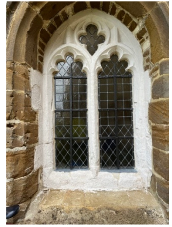
North Porch window