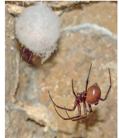
Meta bourneti – a female cave spider with her egg sac.

A local management team keeps an eye on the building and ensures the churchyard is kept tidy.