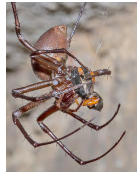
Cave spider with beetle prey.